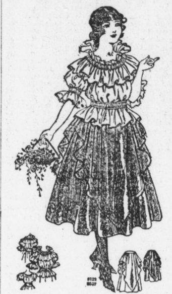
9129 (With Basting Line and Added Seam Allowance) Gathered Blouse, for Misses and Small Women, 16 and 18 years.