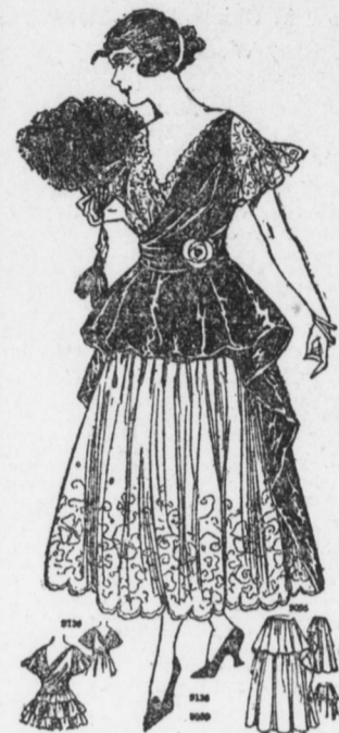
9136 (With Basting Line and Added Seam Allowance) Evening Bodice, 34 to 44 bust.