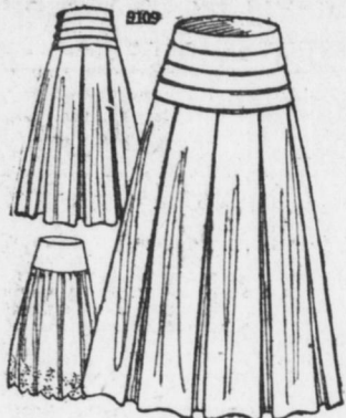
9109 (With Basting Line and Added Seam Allowance) Box Plated Skirt, 24 to 32 waist.

This is a skirt that is exceedingly simple and easy to handle and it can be made to give two entirely different results. It consists of a circular yoke and straight lower portion, but this lower portion may be either box plated or gathered.