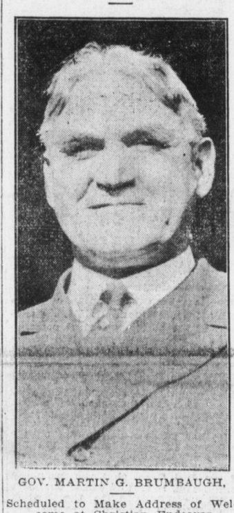
GOV. MARTIN G. BRUMBAUGH, Scheduled to Make Address of Welcome at Christian Endeavor Convention.