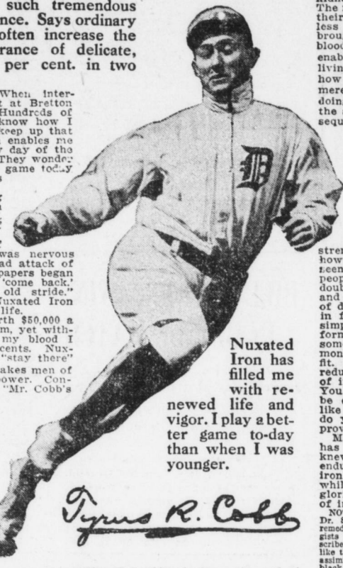
Nuxated Iron has filled me with renewed life and vigor. I play a better game to-day than when I was younger.