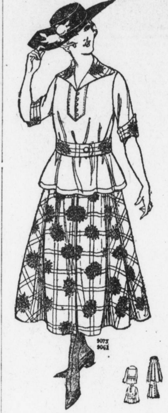
9073 (With Basting Line and Added Seam Allowance) Middy Blouse, 34 46 bust.