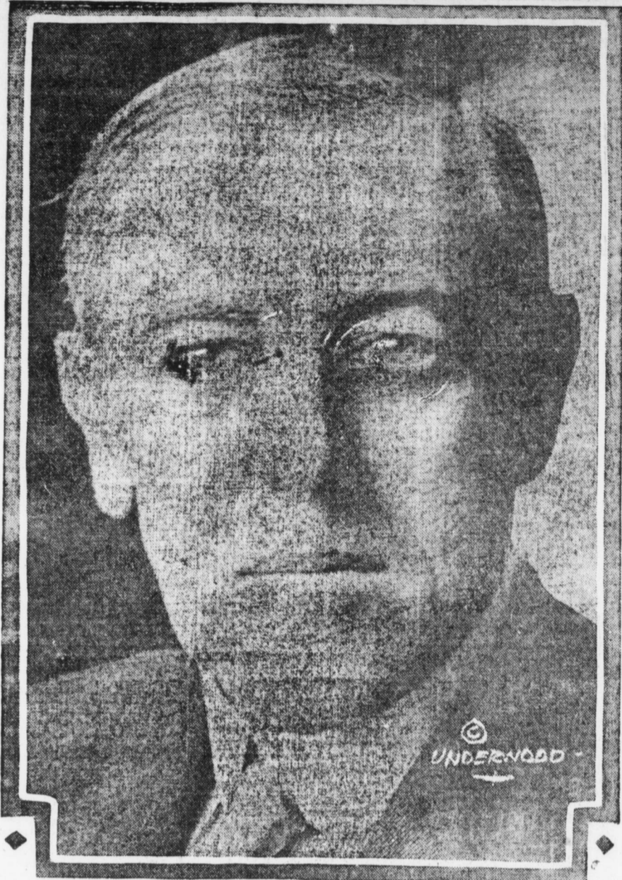
WOODROW WILSON RENOMINATED FOR PRESIDENT BY DEMOCRATS.