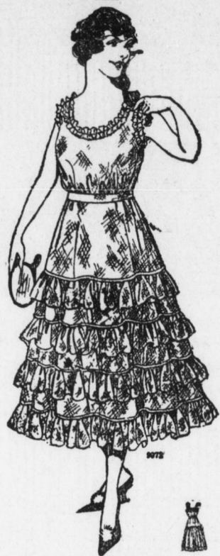
9072 (With Basting Line and Added Seam Allowance) Combination Undergarment for Misses and Small Women, 16 and 18 years.

Useful Combination of Lingerie For Young Girls and Small Women