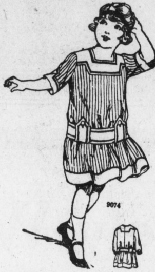
9074 (With Basting Line and Added Seam Allowance) Child's Dress, 2 to 8 years.

Stripes Worn by Small Folks as Well as the Older Ones