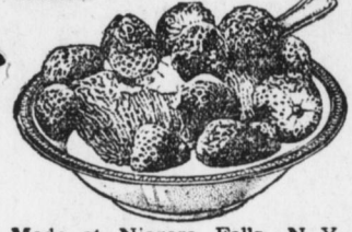
Made at Niagara Falls, N. Y.

Don't Live in the Kitchen —Emancipate yourself from kitchen drudgery by learning the food value and culinary uses of Shredded Wheat Biscuit . You can prepare a most wholesome, nourishing meal in a few moments by heating a few Shredded Wheat Biscuits in the oven to restore crispness; then cover with berries or other fruits and serve with milk or cream.