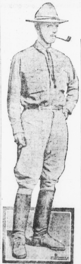
LIEUT. GEO. S. PATTON