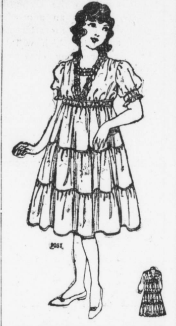
9951 (With Basting Line and Added Seam Allowance) Girl's Dress, 8 to 14 years.

Soft Georgette Crepe or Wide Embroidery Will Develop This Pretty Design