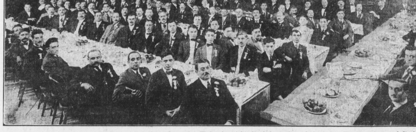
A banquet to the delegates of the Sons of Italy State Convention Wednesday night closed the sessions of the body. The Harrisburg and Steelton members of the order were the hosts of the evening.