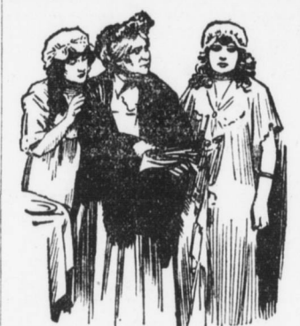
Mona and Mary Help the Laundress Who Was Swindled.