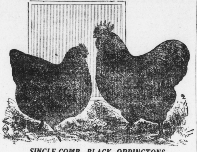
SINGLE-COMB BLACK ORPINGTONS