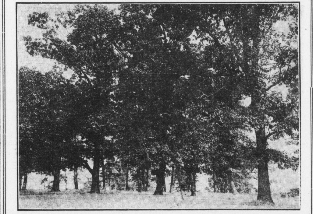
A GLIMPSE OF THE BEAUTIFUL OAK WOODS IN BELLEVUE PARK

One who has built a home and lives in Bellevue Park, says: "We like Bellevue to live in because it is a retired spot away from the bustle and turmoil, smoke, dust and congestion of the city, yet within twenty minutes of the business center. Built on good-sized plots, our houses are flooded with sunshine and air and surrounded by spacious lawns and gardens. "We like Bellevue because of its beautiful park reservations—romantic walks, winding driveways, miniature lakes, rippling brooks, magnificent towering oaks, tennis courts, etc., at the disposal of our families. "We like Bellevue because of the wonderful health-giving advantages it affords our children, with its breezy hills for kite flying, broad grassy fields, and sunny slopes for other sports so dear to "Young America." We do not believe there is a healthier place in Pennsylvania for boys and girls. "Then, too, we like Bellevue for the ever-changing exquisite beauty of its foliage—from the tender greens of Spring, growing heavier and richer and more varied as the season advances, to the brilliant reds, yellows and browns of Autumn. To the lovers of nature this feature is an ever-present joy. "In short, we believe all the other householders share our feeling that Bellevue Park as an ideal home spot is unequaled in Harrisburg, and not surpassed anywhere."