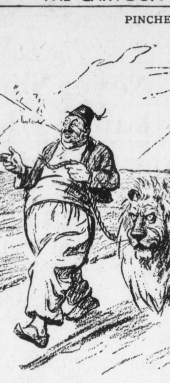
From the New York World.