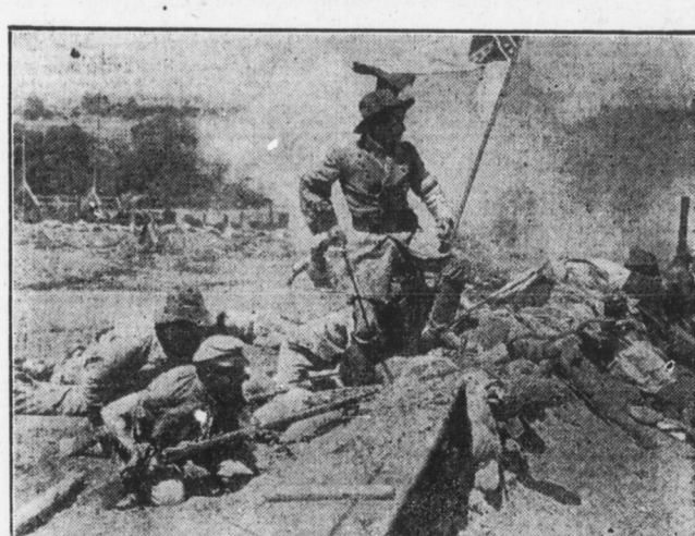
Storming the trenches, a tremendous scene in D. W. Griffith's gigantic spectacle, "The Birth of a Nation," coming to the Orpheum for a return engagement three nights beginning Monday, May 8. Daily matinee at 2 p. m.

You apply it over the stomach muscles. It is gently rubbed on the surface, and makes the muscles pliant; it relieves the strain on ligaments, natural expansion takes place without undue effect upon the nerves. As the time approaches, the mind has gone through a period of repose, of gentle expectancy, and this has an unquestioned influence upon the future child. That this is true is evidenced by the fact that three generations of mothers have used and recommended "Mother's Friend." Ask your nearest druggist for a bottle of this splendid remedy. He will get it for you. And then write to Bradfield Regulator Co., 407 Lamar Bldg., Atlanta, Ga. For a most interesting book of information to prospective mothers, it is mailed free. Write today. It is a book you will enjoy.