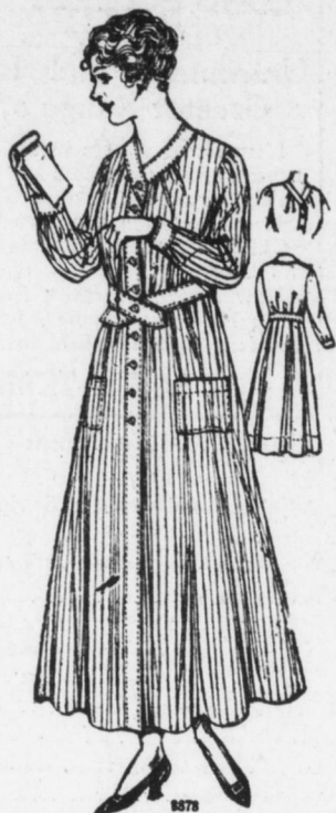
8878 (With Basting Line and Added Seam Allowance) House Gown, 36 to 46 bust.

For the medium size will be needed, 7 3/4 yards of material 27 inches wide, 6 1/2 yards 36 or 5 1/2 yards 44 with 1/2 of a yard 36 inches wide for the trimming.