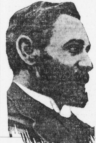
SIR ROGER CASEMENT

London, April 26. — Sir Roger Casement, leader of the separatist faction in Ireland, who was captured while attempting to land arms from Germany, on the Irish coast, was conveyed across Ireland Saturday by a strong armed escort who knew the prisoner only by two initials. He arrived in London without incident and immediately was lodged in the Metropolitan Prison. The fact that Sir Roger Casement has been brought to England to stand trial and is detained in military custody leads to the assumption that he will be tried on the charge of high treason. This charge has been preferred less than half a dozen times in England the last hundred years. The last instance was during the Boer war, resulting in the conviction of Arthur Lynch in 1903. Mr. Lynch, who is now a member of the House of Commons, was sentenced to death but the sentence was commuted and a year later a pardon was granted. The Express suggests the possibility that Sir Roger, if convicted of high treason, may be beheaded, as under the existing law a person found guilty of this offense may, by crown warrant, be given the penalty of beheading instead of hanging.