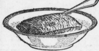
Made at Niagara Falls, N. Y.

Calling Out The "Reserves." Happy is the man or woman who can call upon reserves of health and strength in every crisis.