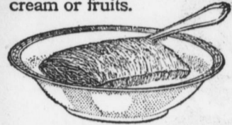
Made at Niagara Falls, N. Y.

Are You Ready for Mr. Germ? "Some little bug is sure to get you" if you do not keep up your powers of resistance by eating nourishing, wholesome, easily digested foods.