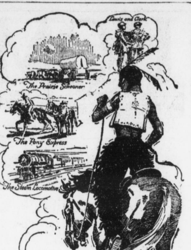
The Prairie Schooner, The Pony Express, The Steam Locomotive