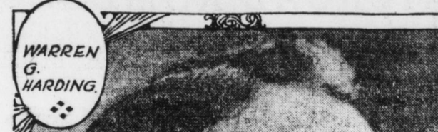
WARREN G. HARDING.