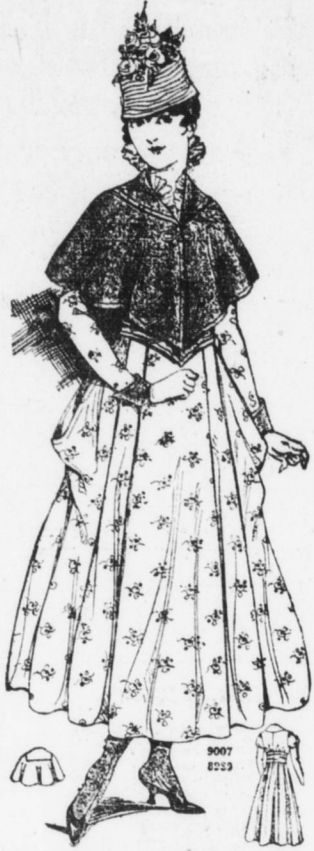
9007 (With Basting Line and Added Seam Allowance) Short Cape, small 34 or 36, medium 38 or 40, large 42 or 44 bust.

Without doubt the cape makes a salient feature of spring fashions. Here is a costume that shows one of plain taffeta worn over a gown of flowered taffeta trimmed with plain.