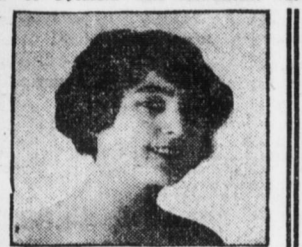
The Pyramid Smile From a Single Trial.