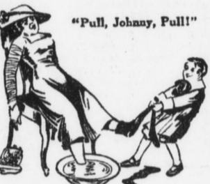
"Pull, Johnny, Pull!"

Instant relief for sore, aching, tender, calloused feet and corns.