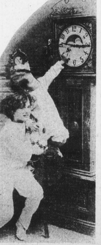
Two of the Clever Kiddies, in "The Kiddies' Burglar"

Remember--All children will be allowed in the theater this week, but no children under ten will be allowed in the theater next week.