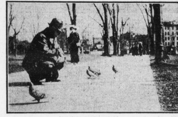
"In Capitol Park"