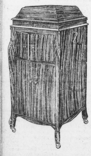
The style illustrated is Vietrola XIV—$150. In oak or mahogany.

Other styles, $15, $25, $40, $50, $75, $100, $150, $200