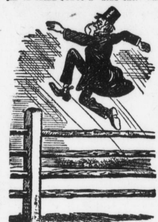
Kellogg's Sanitone Wafers Make You Act Like a Boy, You Feel Just Like Jumping Over a Fence.

50 CENT BOX FREE. Get nerves like steel; be clear-brained; strong and new; eat Kellogg's Sanitone Wafers invigorating and vitalizing as does nothing else.