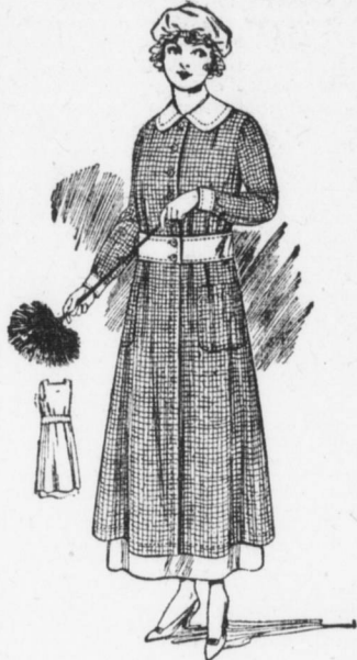
8820 (With Basting Line and Added Seam Allowance) Work Bungalow Apron, Small 34 or 36, Medium 38 or 40, Large 42 or 44 bust.

For the medium size will be needed, 7 1/2 yds. of material 27 in. wide, 5 1/4 yds. 36 for the apron with sleeves; 6 yds. of material 27 in. wide, 5 1/4 yds. 36 for the apron without sleeves, with 1/2 yd. 36 in. wide for the collar, cuffs and belt.