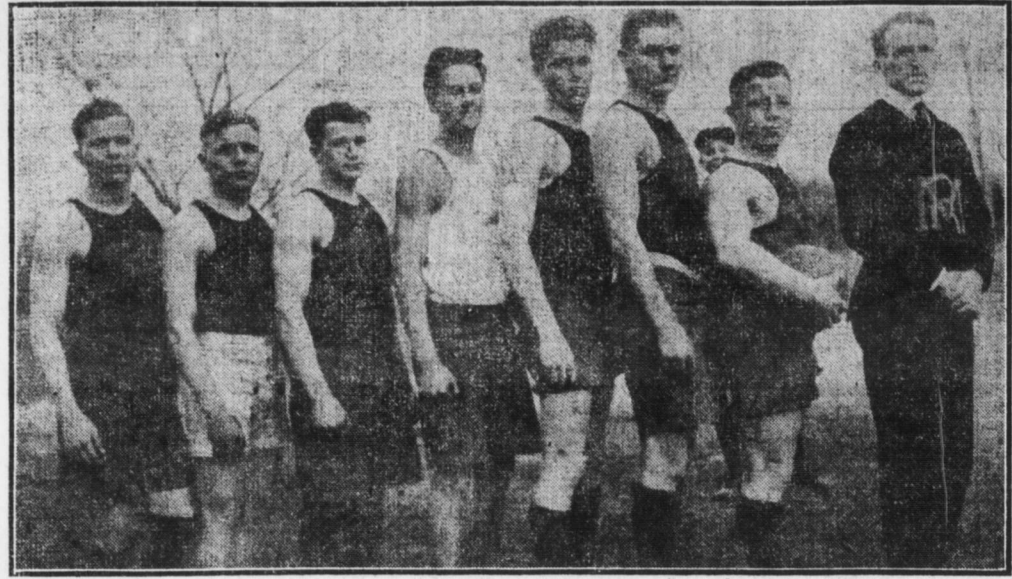
The Harrisburg Academy basketball team has completed a successful season, and one of the longest seasons that they have ever had. Starting in the middle of December against the strong York Collegiate Institute, the Academy made a record considering the obstacles they had to overcome.