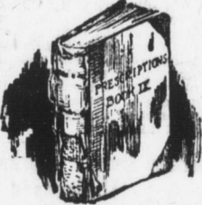
The Old Prescription Book

Perhaps one of the most interesting books is that of the year 1855. On one of the pages of this book, that dated June 9th, 1855, is written the original prescription for Father John's Medicine.