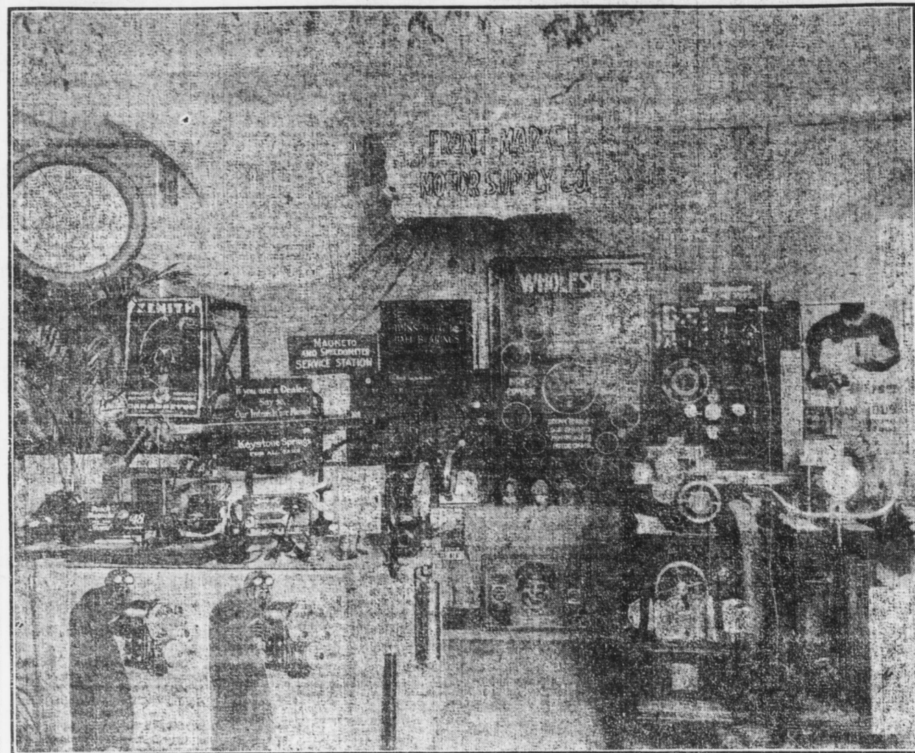
Our Display at 1916 Auto Show

placed on the retired list at his own request. The Eighth's Inspection Orders for the spring inspection of the National Guard by the Guard officers were issued from the adjutant general's office at 1 o'clock this afternoon and make the customary provisions. Dates are fixed for the inspection of each organization. The Governor's Troop will be inspected April 10; Sheridan Troop, May 2; Troop I, Sunbury, April 11; Troop K, Lock Haven, April 12; Troop L, Bellefonte, May 2, and Troop M, Lewisburg, April 13. The Fourth Regiment schedule includes: Headquarters, Columbia, May 1; band, Lancaster, May 2; Company C, Columbia, May 1; Company F, Pottsville, March 28; Company G, Pine Grove, March 30; Company H, Lebanon, March 31; Company K, Lancaster, May 2. The order for the Eighth Regiment is as follows: Field, headquarters company (less band section) and supply company, Harrisburg, Monday, April 10. Band section, Carlisle, Wednesday, April 12. Sanitary detachment, Tamaqua, Friday, April 14. Company A, York, Thursday, May 4. Company B, Tamaqua, Friday, April 14. Company C, Chambersburg, Friday, May 5. Company D, Harrisburg, Tuesday, April 11. Company E, Mahanoy City, Thursday, April 13. Company F, Huntingdon, Wednesday, April 19. Company G, Carlisle, Wednesday, April 12. Company H, Pottsville, Monday, April 17. Company I, Harrisburg, Monday, April 19. Company K, York, Wednesday, May 3. Company L, Bedford, Thursday, April 20. Company M, Lewistown, Tuesday, April 18.