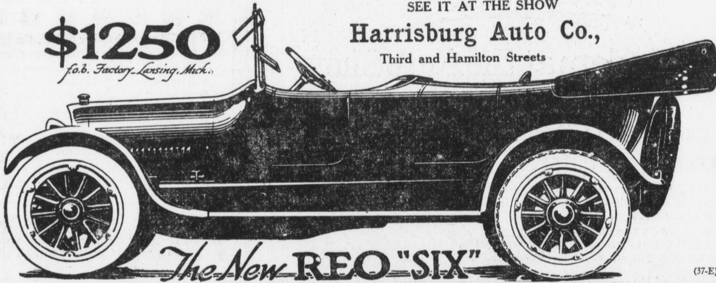
The New REO "SIX"