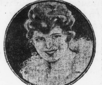
My Beauty Secret! Just Use Stuart's Dyspepsia Tablets for Good Digestion! Let Nature Do the Rest!

Try Stuart's Dyspepsia Tablets FREE Nothing will spoil the complexion, dim the eyes, and cave in the cheeks quicker than digestive troubles.