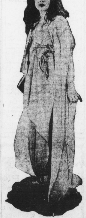
MARIE DORO There are some beautiful classic dancing scenes in the heart of a deep forest, thrilling spectacles of the wood- land atre by night, and daring rescues in 'The Wood Nymph,' the delightful Fine Arts Triangle which will be shown at the Colonial Theater during the first three days of the coming week.

William Vaughan Moody's famous American play, 'The Great Divide,' the story of a real East- ern girl's hatred and sentimental romance is Victoria offering for an untamed rough character of the West, which is well remembered as the play in which Henry Miller and Margaret Anglin starred successfully for many seasons, is the latest offering to be made in motion picture form at the Victoria Theater. The play has been produced in five acts by the Lubin Company with House Peters and Ethel Clayton in the roles formerly played by Mr. Miller and Miss Anglin.