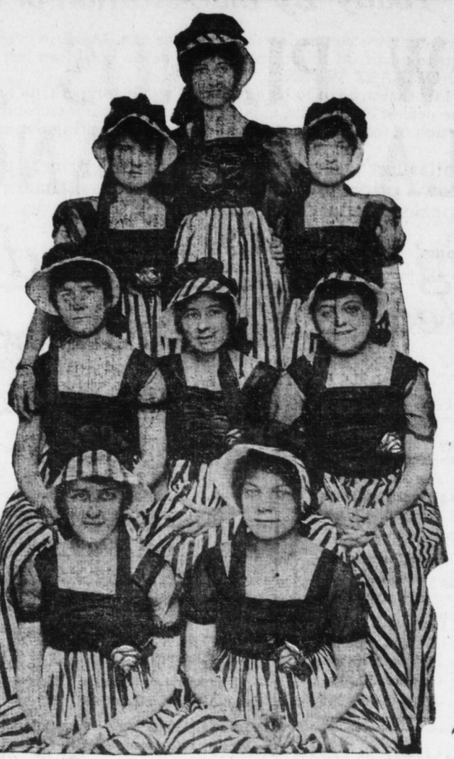
Here are the girls who will offer you candy as sweet and appetizing as themselves—if such things were possible—at the Sunshine Society opera, "The Magic Wheel," to be played at the Orpheum Theater Friday and Saturday.