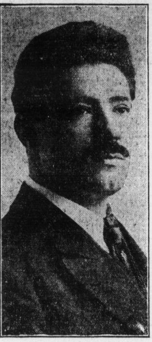
One of the most conservative musical publications in the world is Grove's Dictionary of Music and Musicians.

"Fatty and the Broadway Stars" tells of a busy, sweeping janitor (Roscoe Arbuckle) and his favorite heroine, a burlesque on the methods and efforts necessary to produce a film.