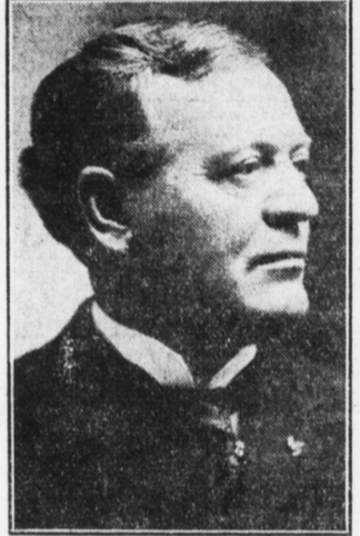
MAYOR EZRA S. MEALS, Department of Public Affairs.