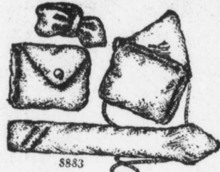
8883 (With Basting Line and Added Seam Allowance). Combination Muff, Bag and Neck Piece, One Size.

This is one of the latest and most interesting variations of the neck-piece and muff, for the muff is in envelope style and includes a practical, useful pocket beneath the flap.