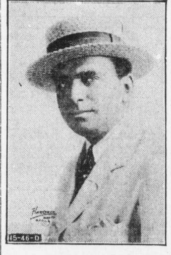
Triangle Presents Douglas Fairbanks in a Jekyll and Hyde Tale of Dual Personality.

Douglas Fairbanks gets in some good laughs and comic effects in the dual personality play "Double Trouble," which will show at the Colonial Theater to-day, to-morrow and Wednesday. Fairbanks has to be timid and backward with all but elderly ladies in his role as Florian Amidon, a young banker. As Mr. Brassfield, the rich oil promoter, Fairbanks is amusing in his aggressiveness both in business and in dealing with affairs of the heart.