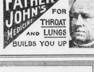
FATHER JOHN'S MEDICINE FOR THROAT AND LUNGS BUILDS YOU UP