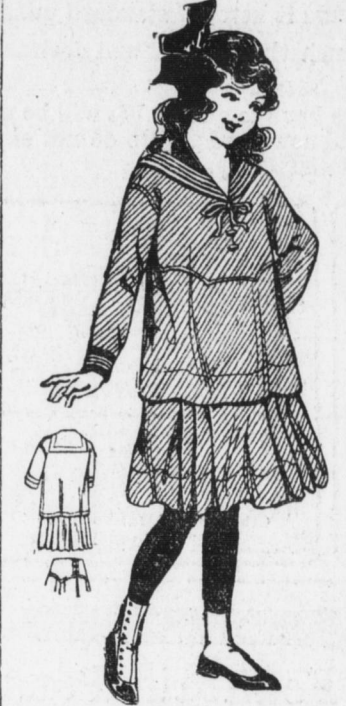
8812 (With Basting Line and Added Seam Allowance) Girl's Middy Dress, 8 to 14 years.

Middy frocks are always desirable for the school girls and this season they seem to be in exceptional demand. This one is made with an applied yoke and with the dropped sleeves that are becoming and at the same time, simplify labor. The skirt is cut in five pieces and the front and back portions are plaited, while the sides are plain and are joined to the yoke. In the illustration, the material is blue serge, with collar and cuffs of taffeta, but white serge is liked for the more dressy effect and a great many mothers will make the blouse of one material and the skirt of another, and just now, there is a fancy for using crepe de chine for blouses to wear with serge or whatever material may be preferred. The pattern gives both the seams and the basting line.