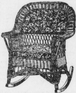
This Brown Reed Rocker $8.95