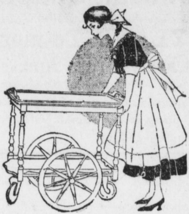
Mahogany Tea Wagons $7.95