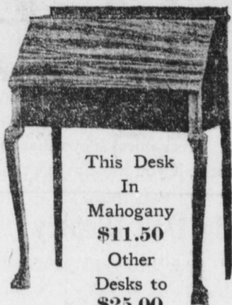
This Desk In Mahogany $11.50 Other Desks to $25.00