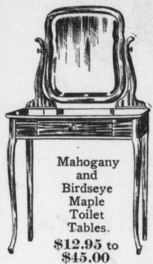
Mahogany and Birdseye Maple Toilet Tables. $12.95 to $45.00