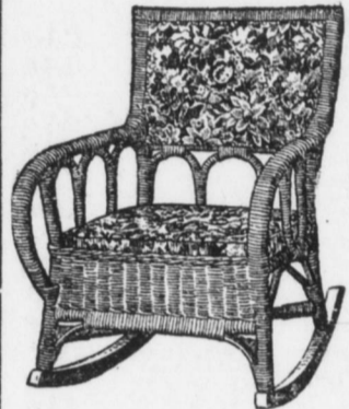
This Brown Fibre Rocker $5.95