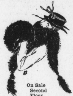
On Sale Second Floor

Featuring attractive new Scarfs and Muffs of Rabbit and Tiger Skins. Animal scarfs and choice of pillow or melon muffs at these extremely low prices.