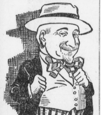
Kellogg's Santone Wafers Are the Secret of Being Vigorous at 70 as When You Were 25.

50c BOX FREE. What you ARE, not what you WERE, is what counts in the game of life.