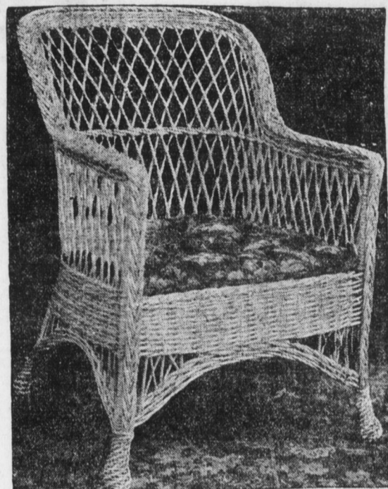
Willow chairs, as shown on the right, with fancy cretonne cushion; not more than two will be sold to each purchaser. Extra special..... $2.95