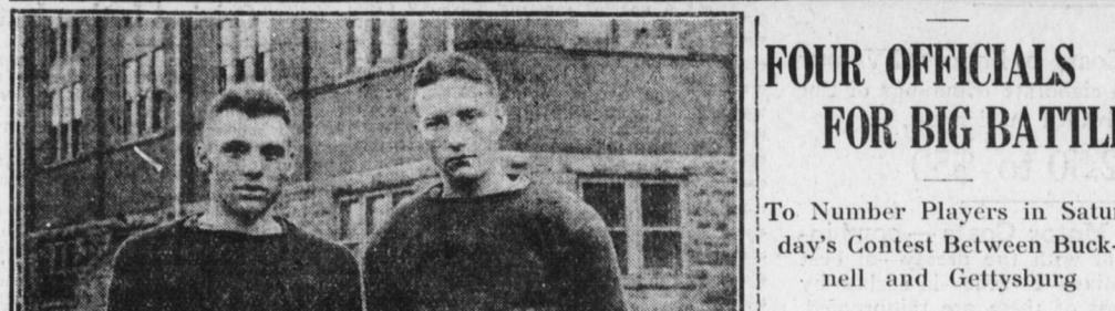
The advance guards from Bucknell and Gettysburg will arrive in Harrisburg to-morrow. They will arrange the final details for the annual battle at Island Park Saturday afternoon. The special trains with the students will reach this city at noon Saturday. The game starts at 2:30 o'clock.

In accordance with the intercollegiate rules this season four officials will be picked for this game. They will be announced Friday night, following a conference between the managers. Bucknell players will be numbered, and it is probable that Gettysburg will fall in line for this feature.