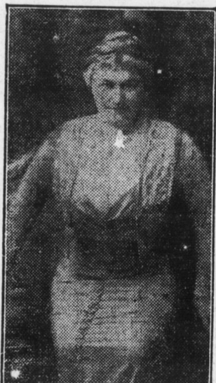
MAY IRWIN Famous American comedienne who will be seen on Friday evening at the