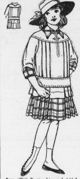
8791 (With Basting Line and Added Seam Allowance) Girl's Dress, 6, 8 and 10 years.

Mothers who are considering the school wardrobe for the fall, will find this frock a most satisfactory one. It gives just a suggestion of the Norfolk idea that is so fashionable this fall.