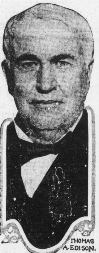
THOMAS A. EDISON

After devoting months of study to the subject the Harrisburg Light and Power Company to-day tested out the new system of clearing the fine dust and ashes from the smoke of the Ninth street power plant.