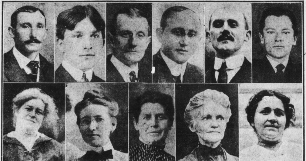
All of the committees appointed to take charge of various parts of West Fairview's celebration program have done their work well. Above are shown the chairmen of the committees.