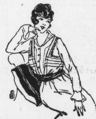
$3.95—crepe de chine straight line collar; beautiful embroidered designs on front. BOWMAN'S—Third Floor